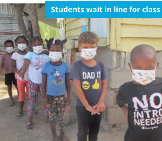
Students wait in line for class

The dramatic educational inequity emerging from this academic school year highlights the importance of Yspaniola's programming. We are committed to doing all that we can to support student learning and see a fully literate Batey Libertad.