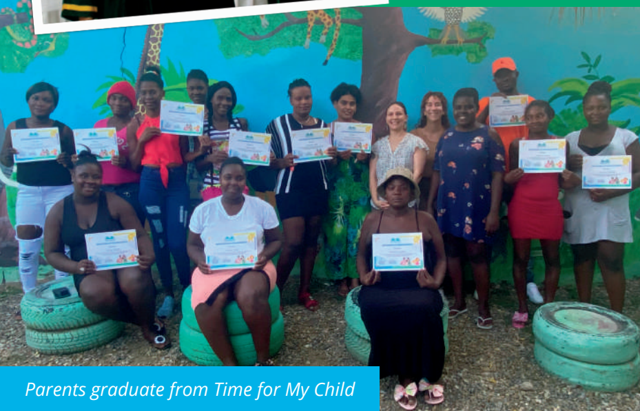
Parents graduate from Time for My Child

A community survey conducted by Yspaniola in 2020 revealed that 60% of parents in Batey Libertad didn't feel confident helping their children with homework.